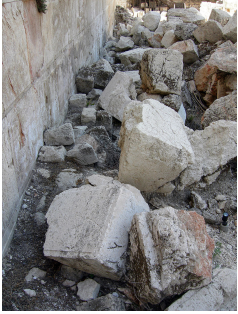
Rock left after Temple Destroyed